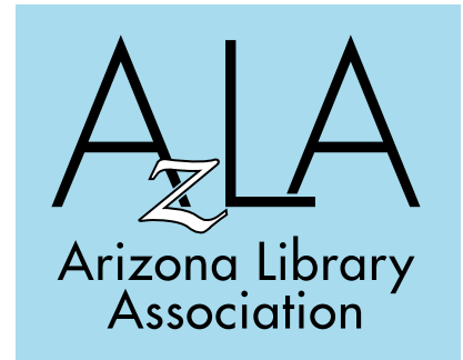
AzLA b/w solid blk logo: how it looks on top of a background