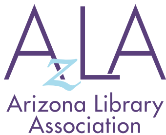
AzLA full logo

The full logo is the preferred method of display. If the logo is used without the wordmark, then Arizona Library Association should be displayed somewhere on the page as a heading or subheading so that there would be no confusion as to what the acronym AzLA stands for.