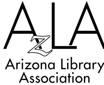
AzLA b/w solid blk logo