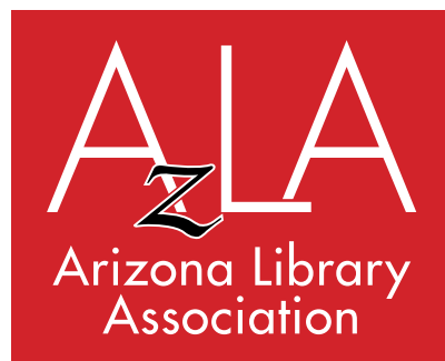
AzLA reverse solid logo: how it looks on top of a background