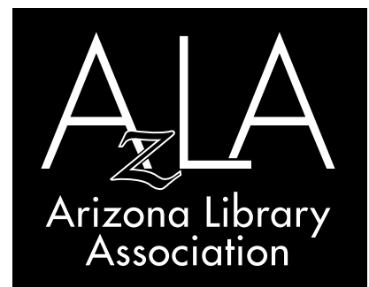
AzLA reverse solid logo: how it looks on top of a background